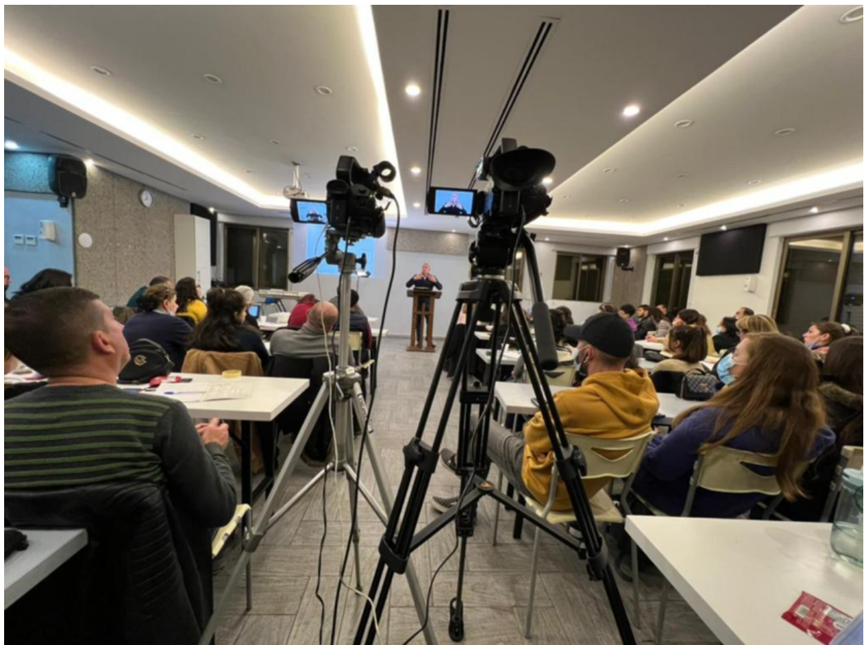
Students attending online sessions.

So far, the program has been in high demand, launching with a cohort of more than 240 students! While most students are local, the EAA Academy also hosts students from other Middle Eastern countries, even parts of Europe through online connections. The program is open to youth (ages 13+) that feel they are being called into ministry or leadership within the church. The program is also offered tuition free so that income is never a barrier for those wishing to participate.