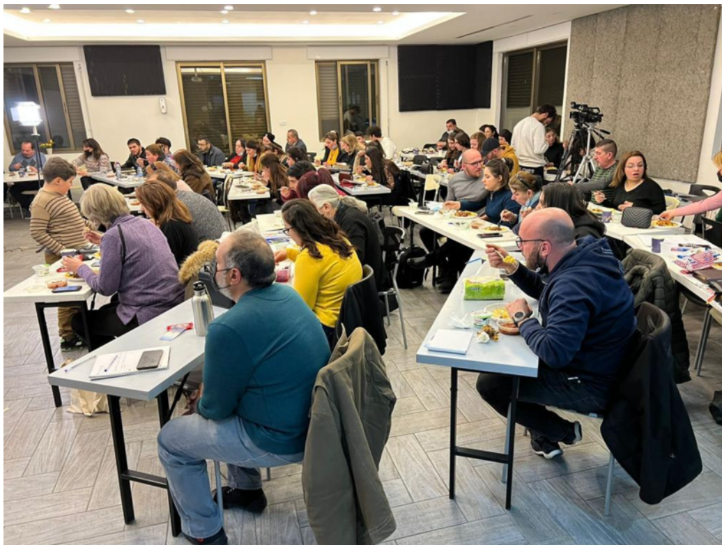
Group meeting in person.

Now, as refugees, many of these persecuted individuals and families are more open to the Gospel than ever before and the church needs a new group of compassionate and trained leaders to reach these marginalized communities around the Middle East.