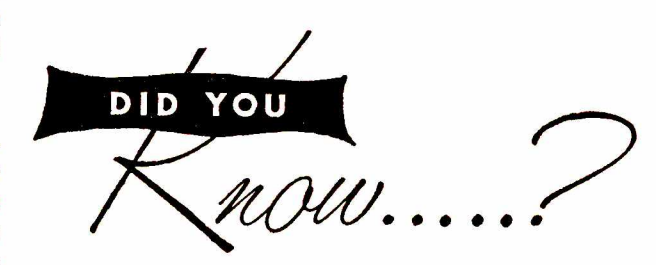
During the past twelve months nearly 50,000,000

What should we do about these hindrances? Let's remove them and follow our Lord's teaching along this line. Let the preachers preach and