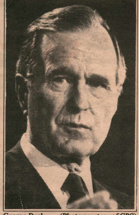
George Bush college students is to look at Bill Clinton's

plan, which calls for government intervention andgovernment jobs," he said. "We don't want to spend the next 20 years building bridges."